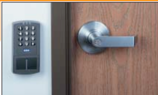
Control unit shown mounted in a typical configuration.